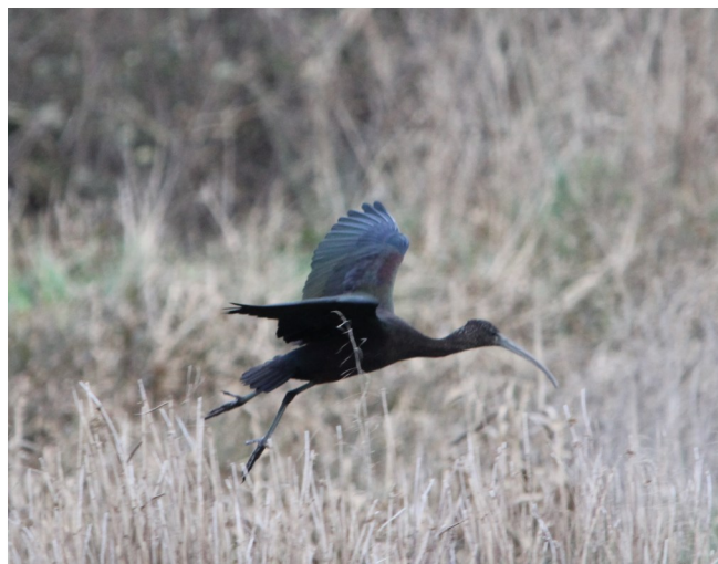
Glossy Ibis taken at the January Bird Watching session

We did meet outside in smaller groups a number of times during the summer, but this is becoming less appealing as the weather changes! I have not totally ruled this out from time to time. I am hoping to initiate a regular sharing of writing via email, possibly once or twice a month.