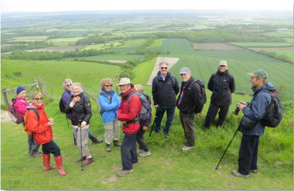
A local Geology Field Trip in 'normal' times

We had to get used to having sessions on Zoom. I indulged my love of Chemistry and ran five sessions explaining the basics as they relate to Geological phenomena.