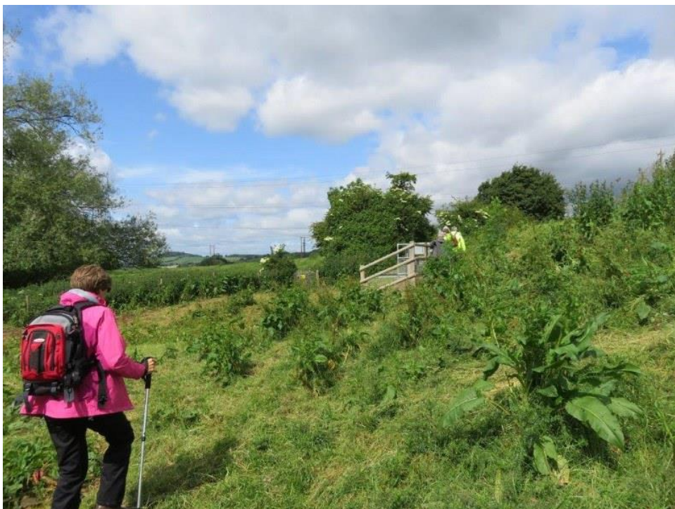
The Stank on the right with modern sluice gate

We started off from Mordiford Bridge by walking along the Stank, an ancient earth work to prevent flooding and to use the flood waters to enrich the soil. Our first stop was to see an ancient lock gate. The Stank has been strengthened several times in the last few years. This area is particularly vulnerable to flooding as it is the confluence of the Lugg and the Wye.