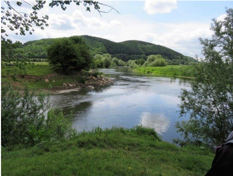
Confluence of the Lugg and the Wye with a naturally occurring gravel beach on the right and man-made protection of the bank on the left.