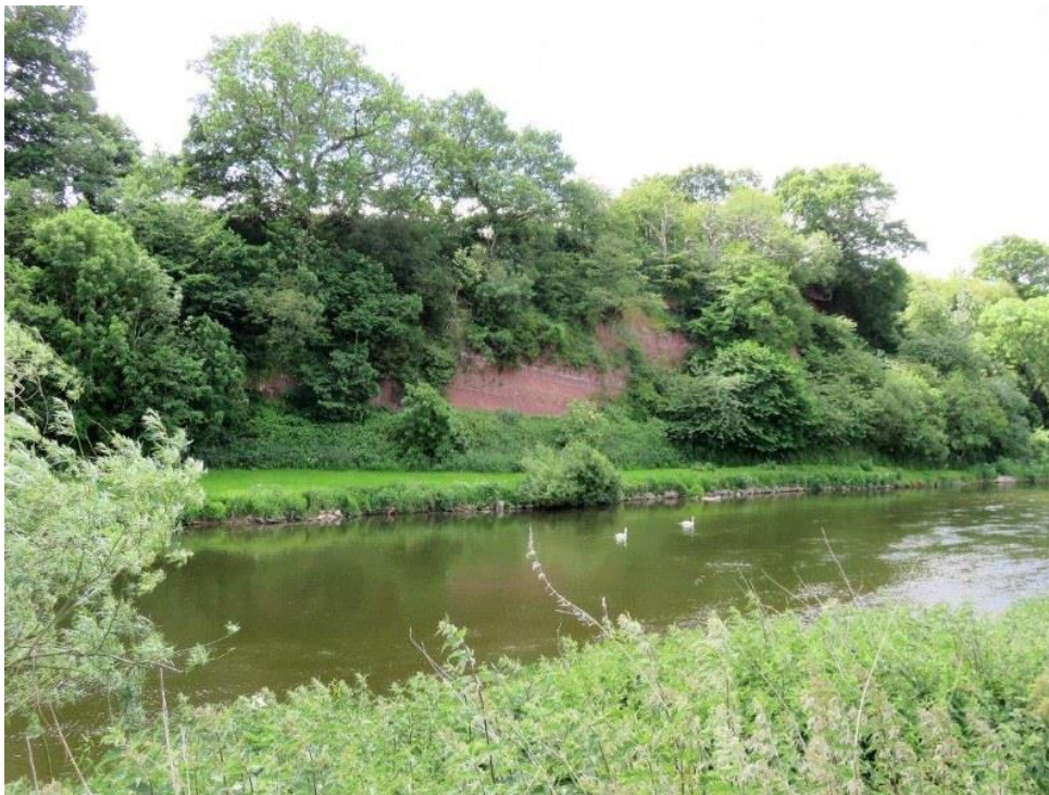
Red Bank Cliff, closer viewing of this exposure possible from a canoe.