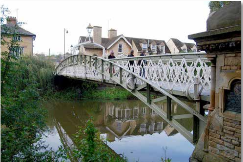
Iron Bridge at Stamford