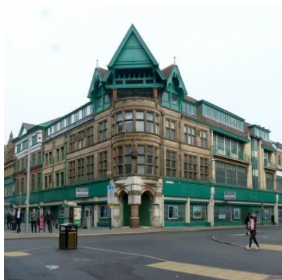
Former Fenwicks building

now been converted into the Gresham Aparthotel. The old green exterior has been replaced by grey.