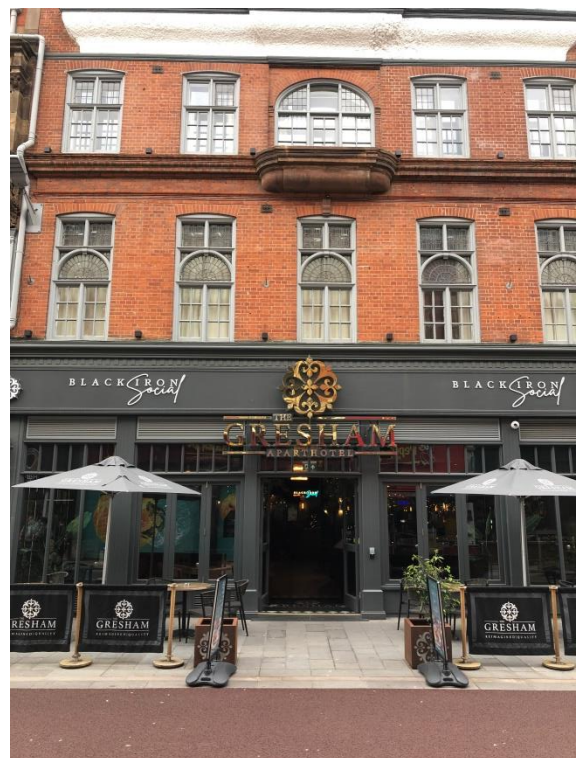
Market Street Frontage