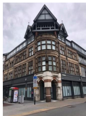
The refurbished building at the junction of Market Street and Belvoir Street

We were split into two groups to be taken round. All 120 rooms have a small fully equipped kitchen, some residents stay for a night or two whereas others, such as someone who came because his house had been flooded, stay for some months. We asked about the occupancy rate and found out that for some nights recently it has been 100%. Most of the rooms cost between £100 - £120 a night but the price varies, not only with the size and luxuriousness of the room, but also how full the hotel is on on a particular night. Some of the rooms had a double bed or two single beds and a sofa bed so could put up a family. The Group was curious to see whether any interior features from the old Fenwicks Building remained. All we found was the staircase which led from the ground floor to the first and second floors, but much altered. The lift to the left of the staircase was still there. The original building, being made up of several buildings, had 40 different levels. When we went down below ground level we reminisced about the excellent kitchen department in the Fenwicks basement.