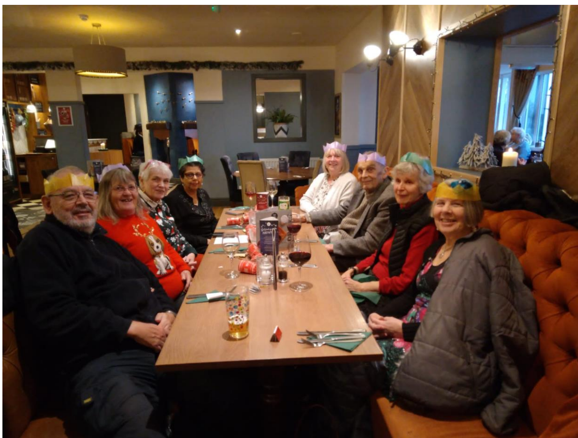
The group at its Christmas lunch

Is usually the second Sunday of the month, but there is no meeting in January. Further information next month. Different venues (decided by people attending) to suit all tastes. Numbers are limited to 20 so book early. If you are interested contact Ros Devine on: lunch@leicesteru3a.org.uk