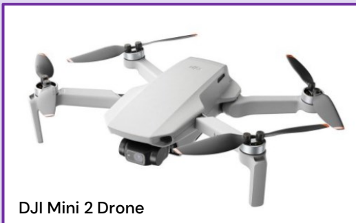
DJI Mini 2 Drone