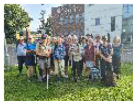
All images are from Summer School 2023