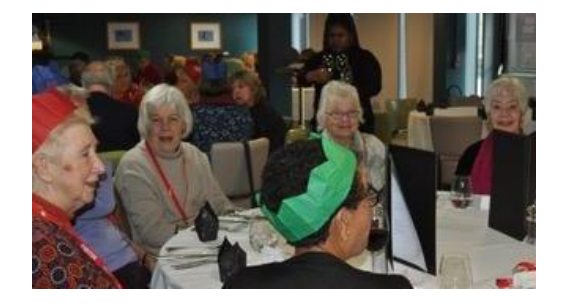
General conviviality at Karibunis

Wednesday 13th December 2023, 30 members of Kings Norton and District u3a 'Lunch Outing Group' had Christmas Lunch at Karibunis Restaurant in the Bourneville College at Longbridge. The Students and Tutors made us very welcome and were really attentive. The food was exceptionally good and everyone seemed to enjoy themselves.