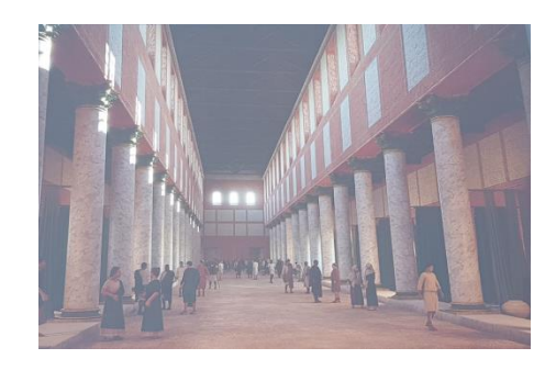
Inside the baths, also used as a community space

Adjacent to the Museum is an accurate reconstruction of a town house (Picture 4).