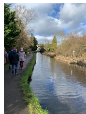
Lovely weather at a recent organised Monday walk in the Loose Valley

Over the next few months, we will be peppering events and excursions commemorating and marking our new-found liberty and we have already started with a full coach to "Calendar Girls" the musical, at the Bob Hope Theatre. If you have an idea, an activity or an event and would like to share it with other like-minded people, we are here to help you make it happen. Let's make this year a year to collect positive memories. Don't forget the u3a is run by the members for the members, so please get involved in any way you can. Contacting us is so easy, the Committee and myself are always here to help, so talk to us at our meeting or look for the contact details within this Newsletter.