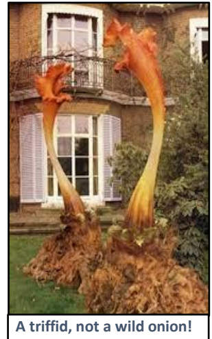
A triffid, not a wild onion!