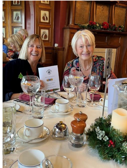
Below: Reading Group 1 enjoying a festive afternoon tea