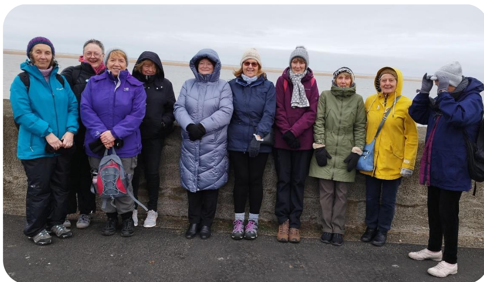
Walking Group 3 enjoy a winter walk on Hoylake Parade