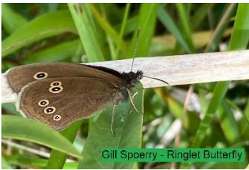
Gill Spoerry - Ringlet Butterfly