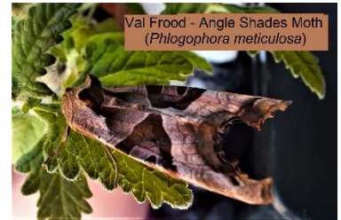
Val Frod - Angle Shades Moth ( Phlogophora meticulosa )