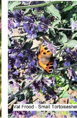
Val Frod - Small Tortoiseshell