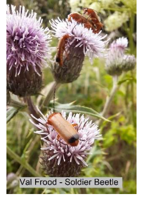
Val Frod - Soldier Beetle