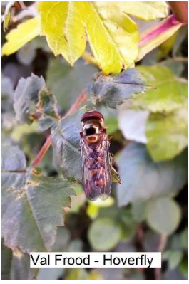
Val Frod - Hoverfly