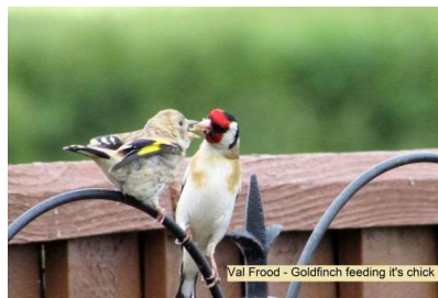
Val Frod - Goldfinch feeding it's chick