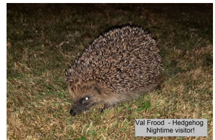
Val Frod - Hedgehog Nightime visitor!