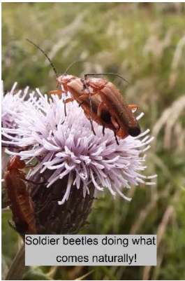
Soldier beetles doing what comes naturally!