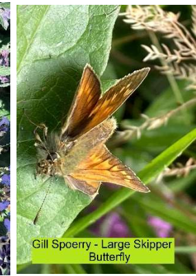
Gill Spoerry - Large Skipper Butterfly