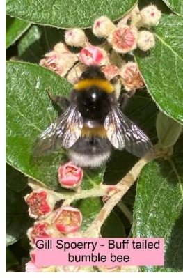
Gill Spoerry - Buff tailed bumble bee