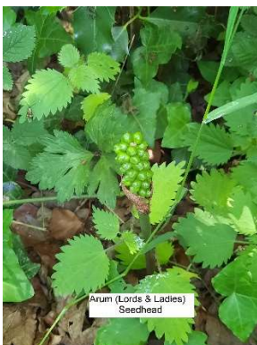
Arum (Lords & Ladies) Seedhead