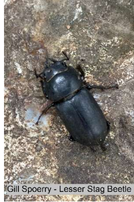
Gill Spoerry - Lesser Stag Beetle