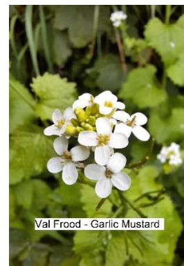
Val Froid - Garlic Mustard