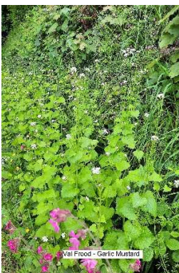
Val Froid - Garlic Mustard