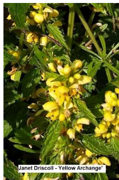
Janet Driscoll - Yellow Archangel