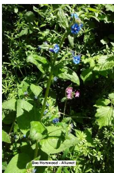
Sue Horswood - Alkanet