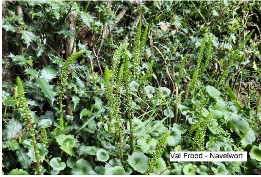
Val Frood - Navelwort