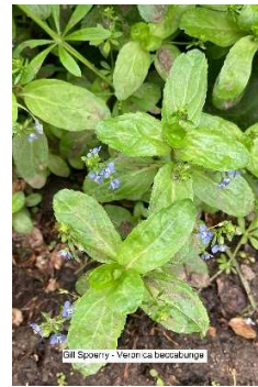
Gill Sperry - Veronica baucabunga