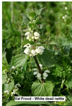
Val Frood - White dead nettle