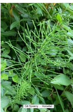
Gill Spoerry - Horsetail