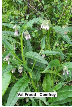
Val Froid - Comfrey