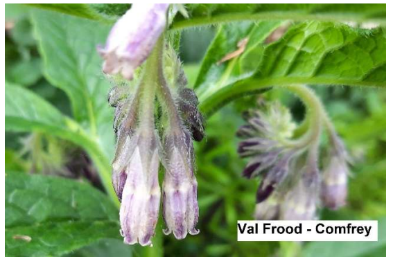
Val Froid - Comfrey