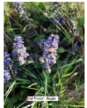
Val Frood - Bugle