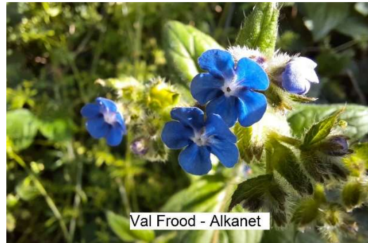
Val Frood - Alkanet