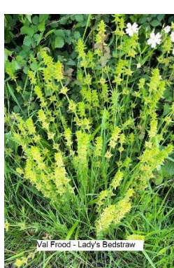
Val Froid - Lady's Bedstraw