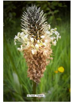
Val Frood - Parthenium