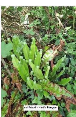
Val Froid - Hart's Tongue