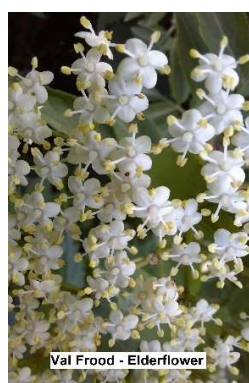
Val Froid - Elderflower