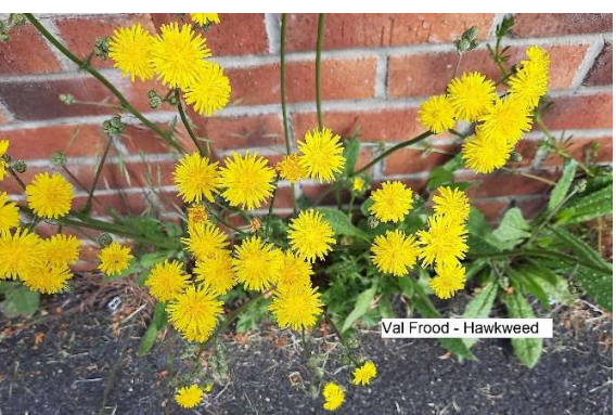
Val Froid - Hawkweed