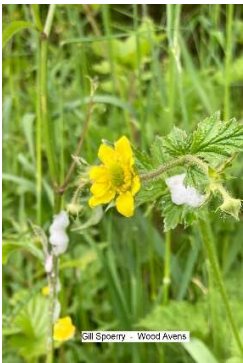
Gill Sperry - Wood Avens