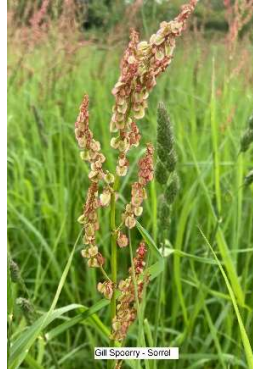
Gill Sperry - Spiraea