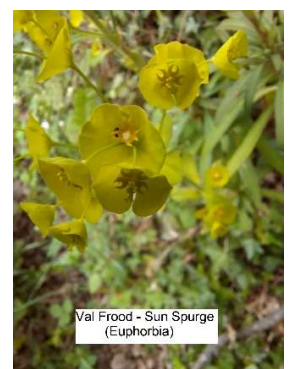
Val Frood - Sun Spurge (Euphorbia)