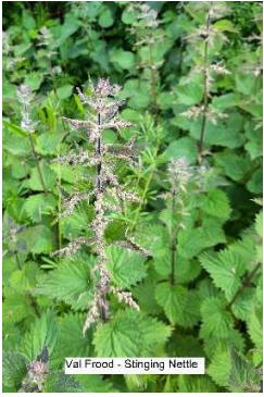
Val Frood - Stinging Nettle