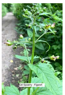
Gill Spoerry - Figwort