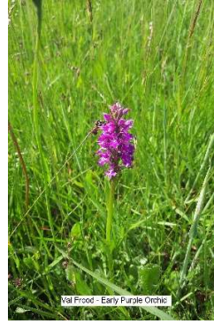
Val Frood - Early Purple Orchid