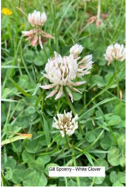
Gill Spoerry - White Clover