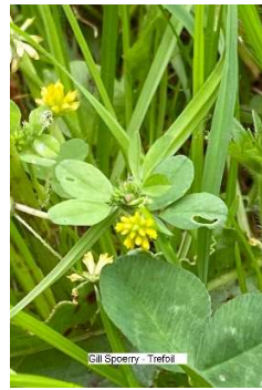
Gill Sperry - Trefolium