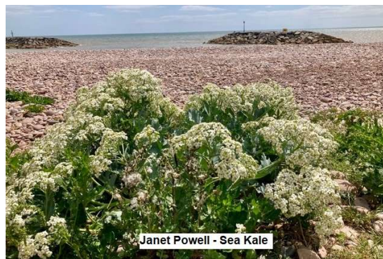
Janet Powell - Sea Kale