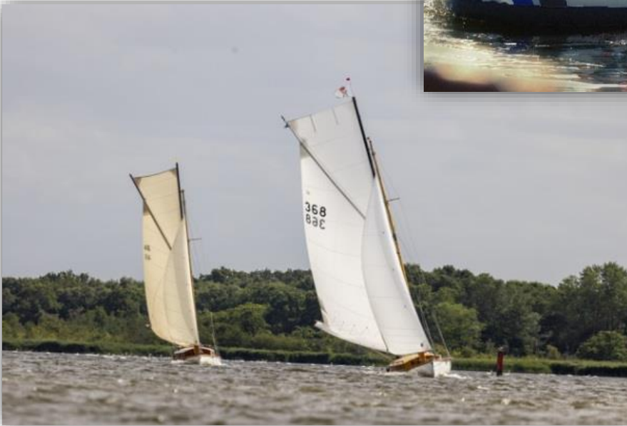
The 'white boats' under full sail

The NWT were pleased to see confirmation that spoonbills had bred in broadland (specifically Hickling) for the first time in several hundred years although they have bred previously in North Norfolk.