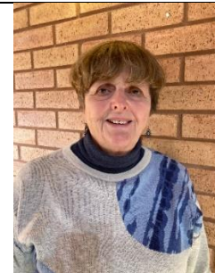
Virginia Committee Member