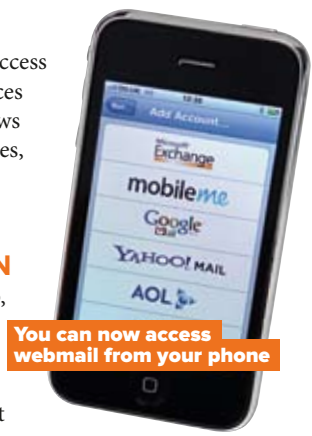
You can now access webmail from your phone

But, incidents like these are rare and, overall, webmail is an easy and safe way to stay in touch. ■