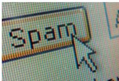
Spam filters will ensure that junk email is sent to the junk folder

Spam (junk email) is the thorn in the side of webmail services. Most of the services we tested incorporate spam filters that intercept such emails, and send them straight to a junk mail folder. Make sure you check your junk mail folder though, as genuine messages can slip through the net. Emails in here will be deleted between 5 and 30 days after they're received.