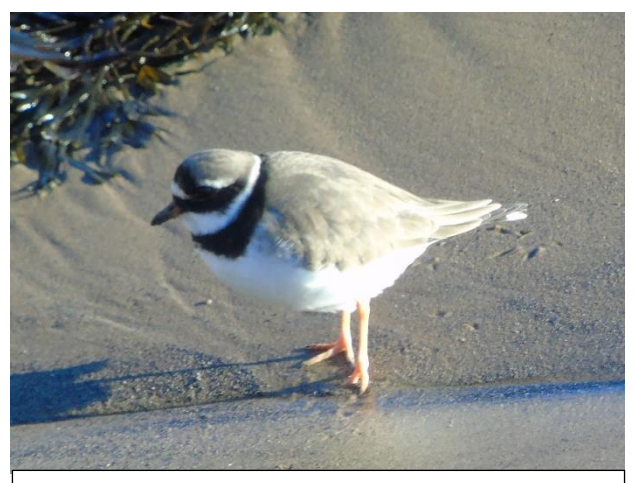
We all took an interest in this unusual little bird, which we believe to be a Ringed Plover.

After following the GLOVIS, we spotted this small vessel, which we thought at first was a day fishing boat, but as it came closer we noticed that it had a large crane and seemed to be moving from one buoy to another – possibly doing some maintenance work? A quick look on-line confirms that the vessel is the TEES GUARDIAN (IMO: 9759783), a Pusher Tug that was built in 2014 (9 years ago) and is sailing under the flag of United Kingdom.