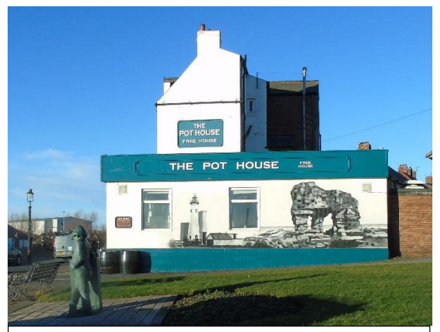
A fine view of the mural on the side of the Pot House showing the famous 'Elephant Rock'.