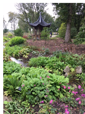
Chinese Streamside Garden, RHS Bridgewater