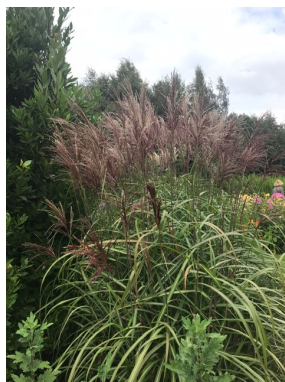
Grasses at Abbeywood Gardens

The next Green Shoots Gardening Club meeting will be held at Rivendell Garden Centre, WA8 3UL at 10.30am on Monday, 16th October 2023 everyone is always welcome.