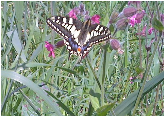
Swallowtail butterfly at Hickling Broad May 2019