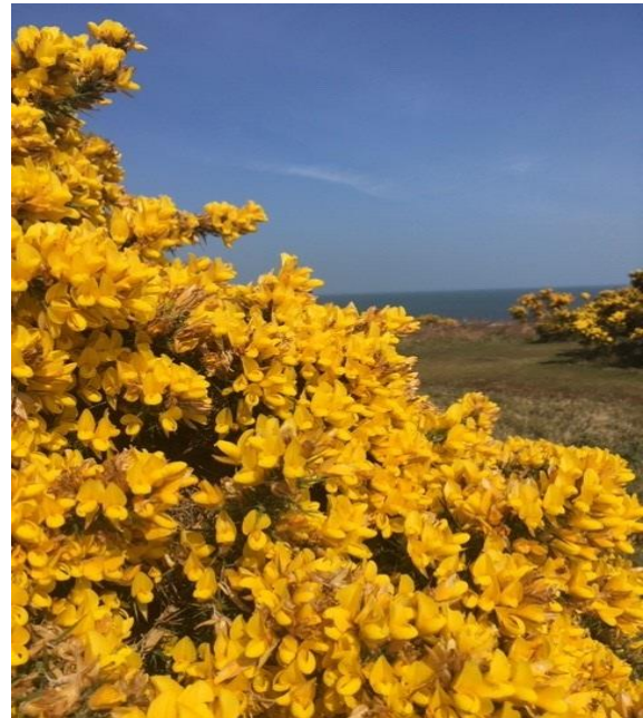
Gorse in flower at Dunwich Heath in April

Finally: you may like to know that every two months; Suffolk Constabulary issues a public newsletter called 'Constables County '. It's available to view on the Suffolk Constabulary Official Web Page and provides a brief update about some of the work the police have been doing in each of their policing localities. Follow the link below to the April edition; there are also links to previous editions. http://www.suffolk.police.uk/your-area/snt-newsletters