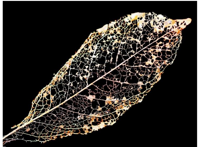
a dry leaf