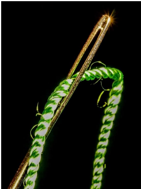
a threaded needle