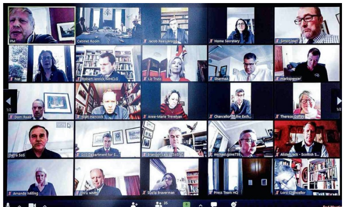
Boris Johnson uses the Zoom app to chair the first ever digital meeting of the UK Government Cabinet while he self-isolates with Covid-19

All that the meeting participants then need to do is to also download the Zoom App or the software onto their computer or phone or tablet. But they don't need to register as a user. Just before the meeting is scheduled to start, the participants then simply click on the 'link' in the invitation email to join the meeting (or gathering or get-together or whatever else you want to call it).