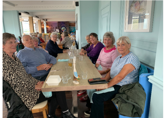
Driftwood Lunch