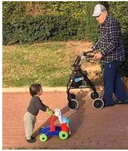
THE CIRCLE OF LIFE

Penguins have been known to push a fellow penguin into the water to check if the water is safe and free of predators.