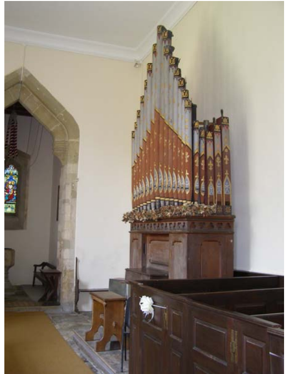
The Victorian organ was restored in 1980 when the hand-pumped bellows were replaced by a fan