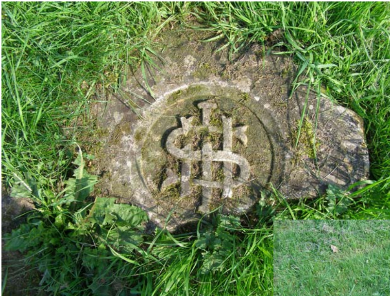
Indexed as C80