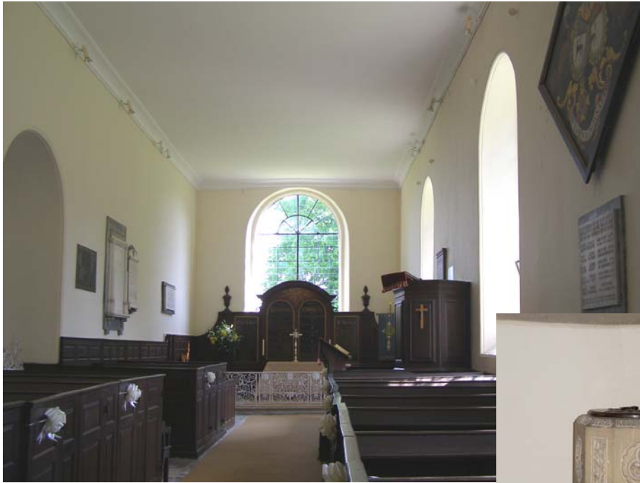
The Stone Carved Font replaced in the mid 1700s