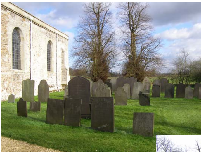
Gravestones June 2008