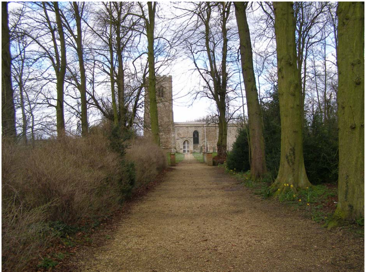
Approach to the Church from the Road