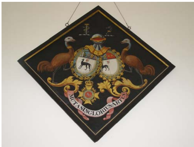
The Arms of physician granted to Sir Henry Halford by George IV in 1826