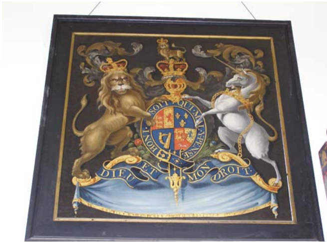
The Royal Coat of Arms of George III