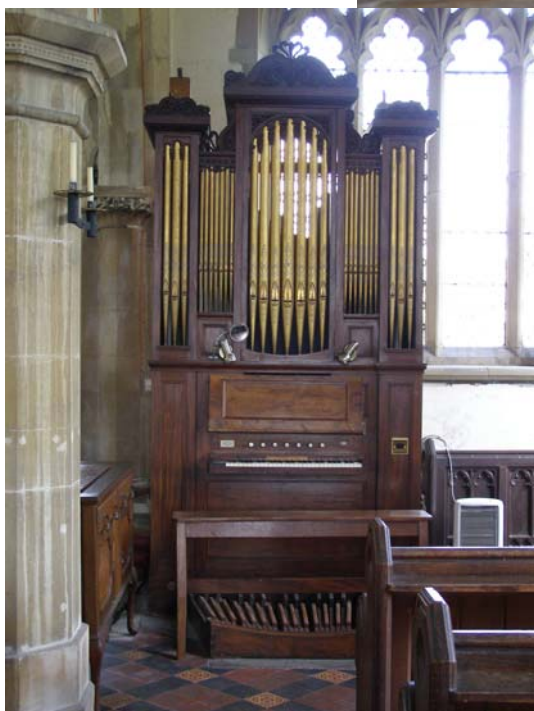
The Church Organ