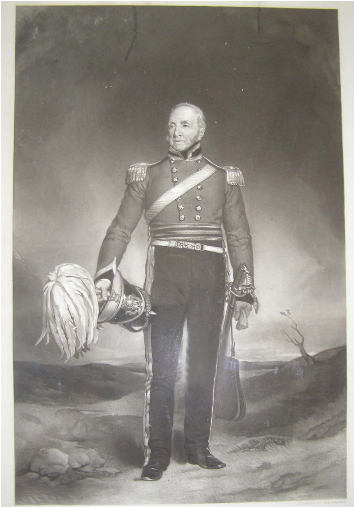
Taken from a wall hanging in the church, and is an engraving by Charles Tomkins