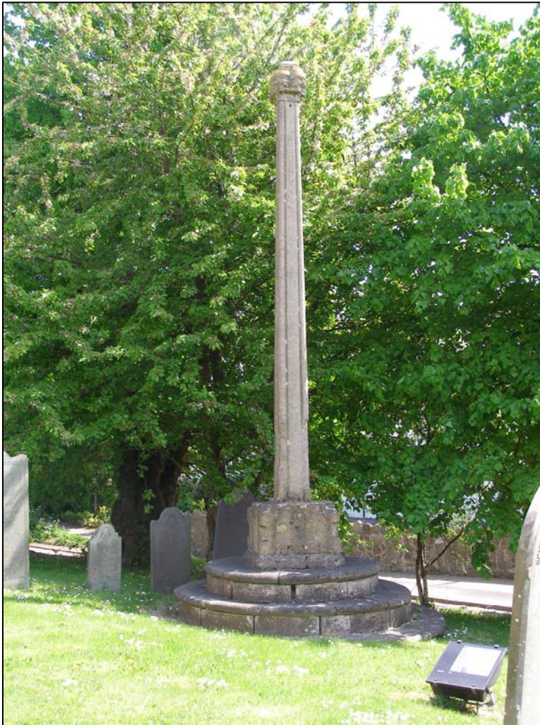
The Cross in Stoughton Churchyard

Those who seek the church will first encounter the 14 th century cross in the shade of the limes of the churchyard. It has been called the most beautiful of all the county's crosses, and there is something in its fluted slenderness, and the elegant simplicity of the shaft with its sculptured capital, to justify such praise. It stands like a warden over the simple memorials of simple folk, surrounding it.