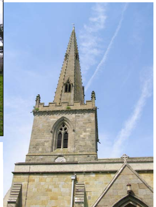
The crocketed spire