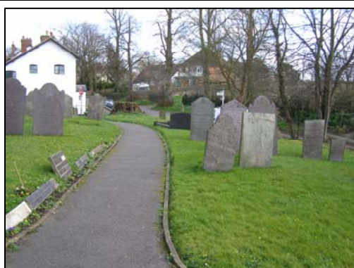
Section A In the churchyard