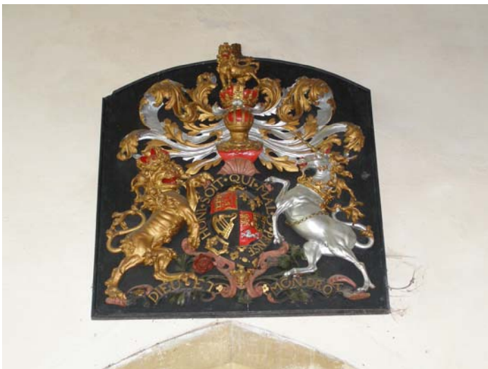
The Royal Coat or Arms