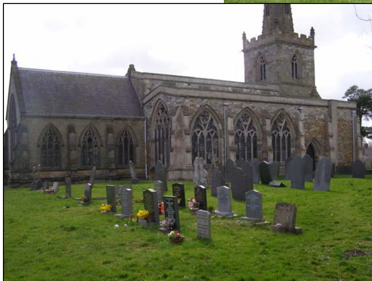
The Beautiful Churchyard