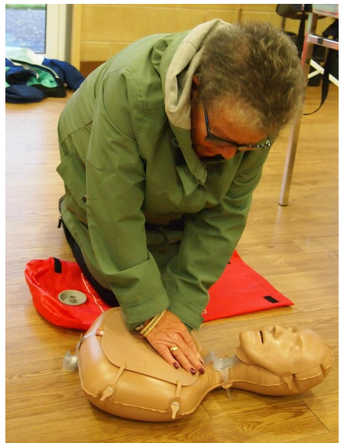
What to remember and do.

This is how to do it. Remember to work as hard as you can, break some ribs and get that Heart beating again.