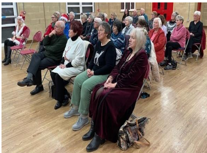
Those at the meeting to join the singing