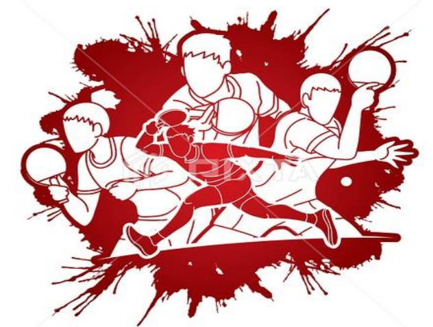
Table tennis group