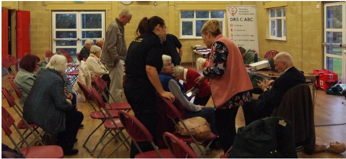
Those at the meeting

North Northants Cardiac First Responders on Resuscitation and Defibrillation