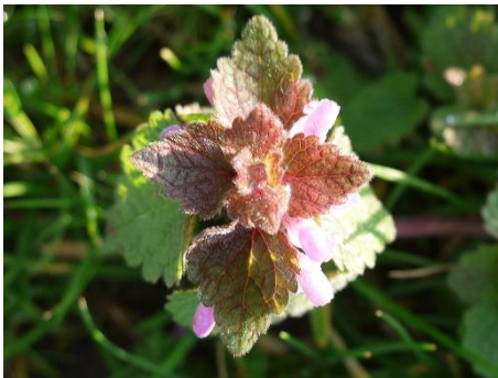
Gardeners hate Nettles but love wine

Laughing at jokes in the Daily Mail; Examine the crossword, I hope I don't fail. Still, I'll have a go, as I don't think I'm dim, Unless my brain's addled, a Result of 'shut in'. Entertainment is short, but it still gives me pleasure. As you can tell, I'm a man of much LEISURE.