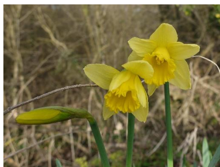
First Daffodil's in Kingswood

There will be a further reduction if individual members had 2020 Membership subscriptions 'in hand' at the time Covid 19 lockdown was introduced and this will be reflected when their Membership is renewed with all members being sent an individual E-Mail or letter advising them of their fee.