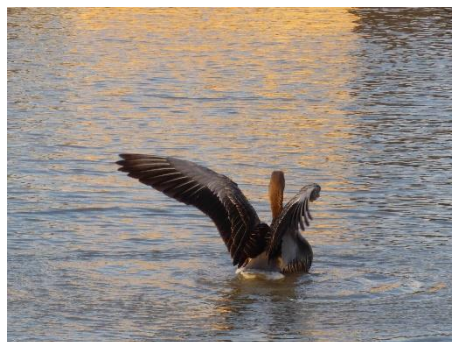
Sunset at the Boating lake

There was a couple of suggestions about involving members more by having Quiz or other On-Line events, trying to have a Meeting / Party in a Park to celebrate our release and having Open Air meetings whenever possible.