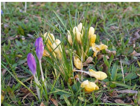
Oakley Vale verge

Or by going to https://www.u3a.org.uk/member-link