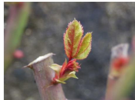
First shoots of Spring and a new start?