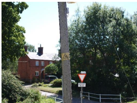
Post, Pole & Chimney Pot

This month due to the heat we took a trip to Medbourne and the Neville Arms and the winning photograph for the target of things beginning with P definitely went to the person in the group who forwarded an apology and a picture of their Positive Covid test.