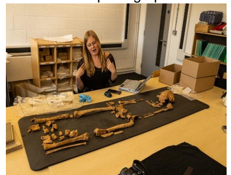
An Old lady

In June we took a Pre-Official Opening trip to Chester house where we went on a tour of the ARC, had a bit of a walk around and tried some awkward targets for our photographs.