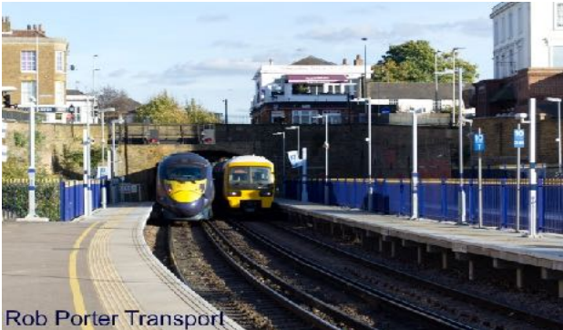
Rob Porter Transport