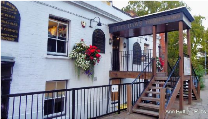
Ann Buttle - Pubs