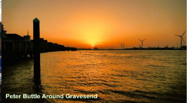
Peter Buttle Around Gravesend

Main Committee - no change from last month