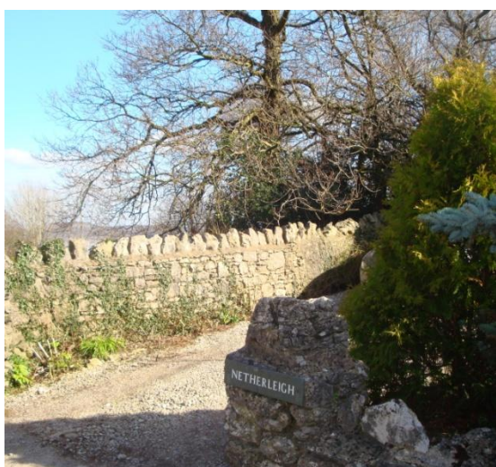
Netherleigh House March 2015. The gable end faces the Bay