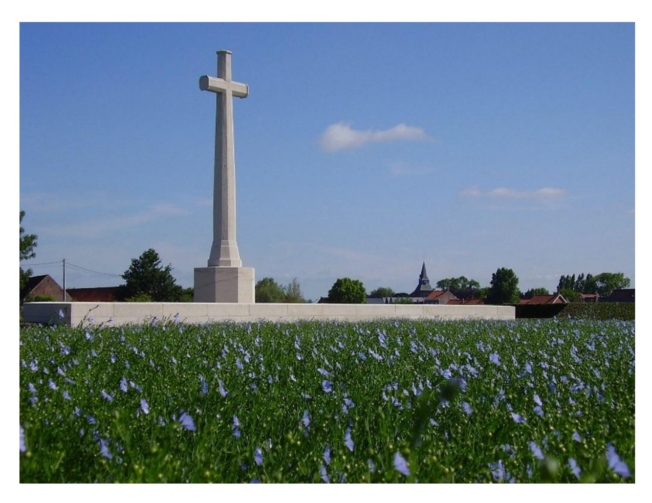
Haringhe (Bandahem) Military Cemetery, Belgium

The details below come from the Grange over Sands Parish Magazine<sup>9</sup> of February 1918 which recorded a memorial service at St Paul's Church, Grange, on Thursday 10th January 1918 as follows: