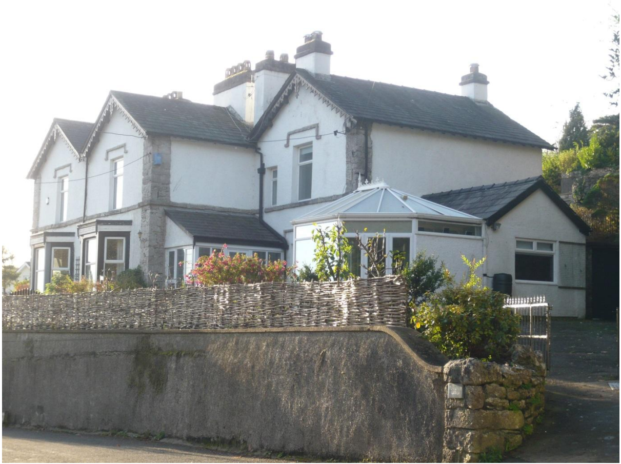
Yewbarrow House Hampsfell Road