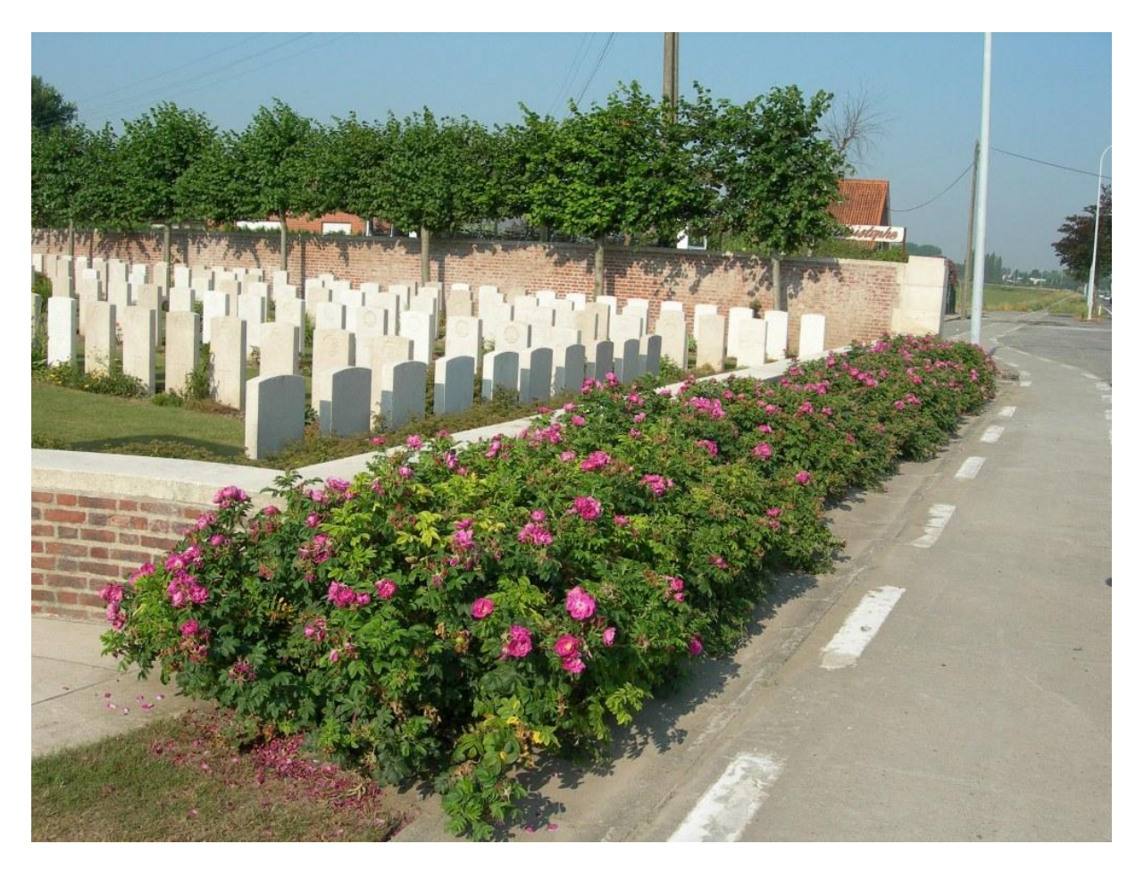
Birr Cross Roads Cemetery, Belgium.

His body wasn't found until 1922 when it was buried at Birr Cross Roads Cemetery, Nr. Ypres.