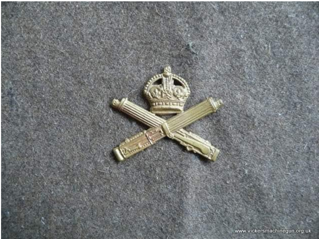
Machine Gun Corps Badge

A short biography in commemoration of Arnold Ainsworth 1876 – 1916