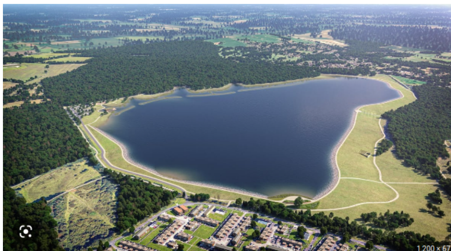
Havant Thicket Reservoir