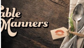
TABLE MANNERS - A PLAY BY ALAN AYCKBOURN THURSDAY 13TH JUNE 2024 AT 7.30 PM - £16 VENUE: THE LITTLE THEATRE

MESSAGE IN A BOTTLE - ROYAL BALLET THURSDAY 30 TH MAY 2024 AT 7.20PM - £15.95 / £22.99 LIVE SCREENING AT SHOWCASE CINEMA OR VUE, LEICESTER