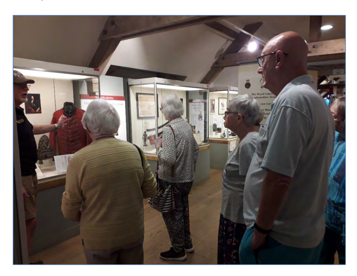
History Group on guided tour of the military museum at Thoresby Park