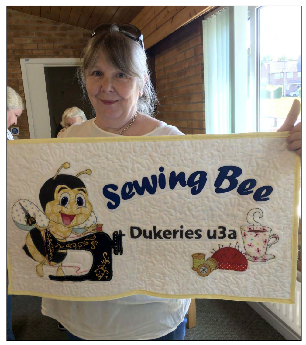
Sewing Bee banner