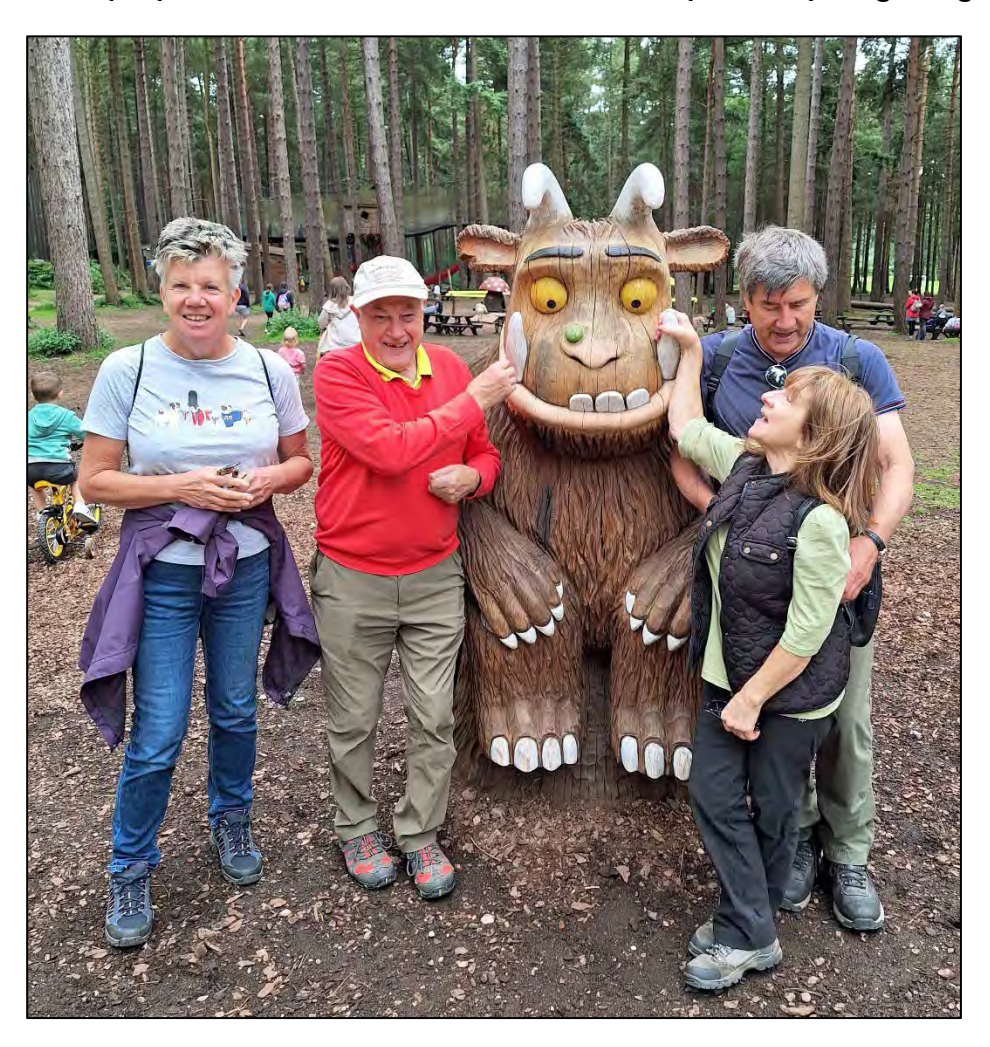
Ramblers at Sherwood Pines