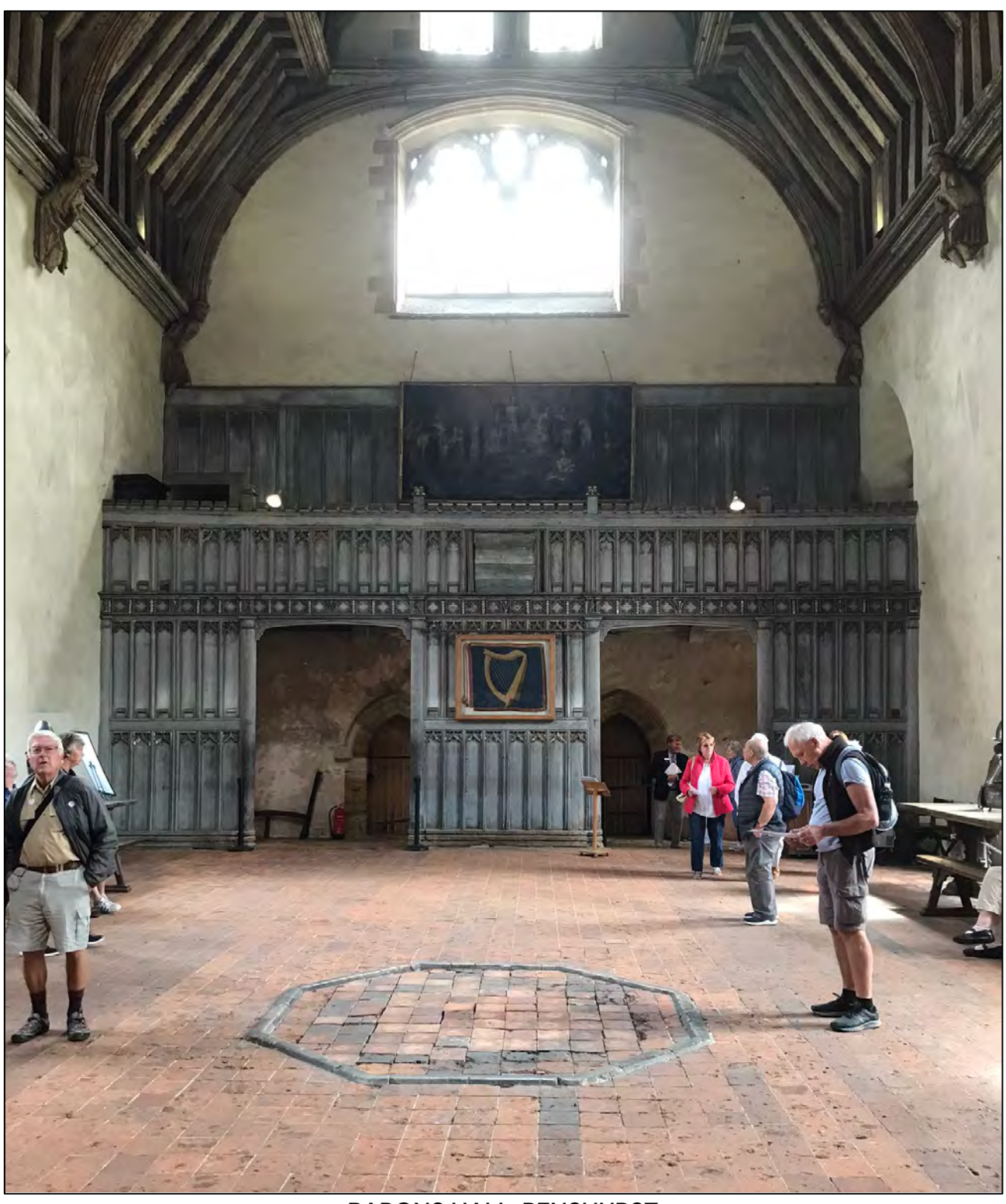
BARONS HALL, PENSHURST

Built in the style of a defended manor house, this is one of England's oldest family homes. Completed in 1341, much of it remains in its original state with two wings joined by a magnificent central hall that would have been hard to surpass for size and splendour. The walled gardens, 600 years old and amongst the oldest in private ownership, are divided into secret and intimate gardens through arches and tunnels cascading with sweet blossom of roses and clematis. Penshurst was used in the BBC filming of Wolf Hall.