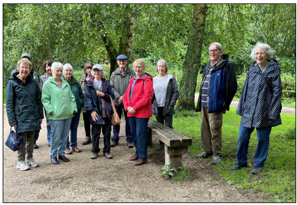
Our "foodies" and "Strollers" have been out and about.