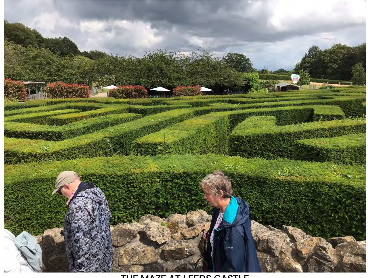
THE MAZE AT LEEDS CASTLE