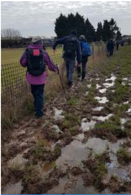
Serious mud on the Langold walk