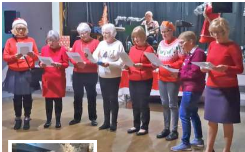
Silent Night sung in German