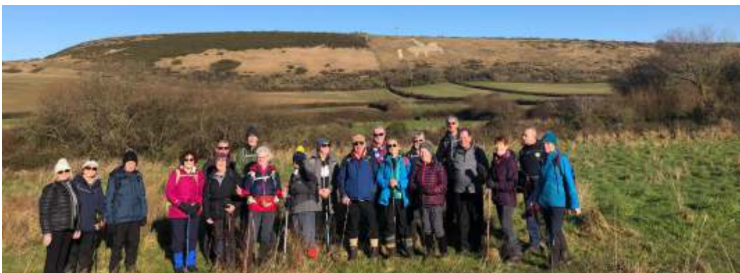
With members of Ashfield u3a walking group on the Weymouth holiday