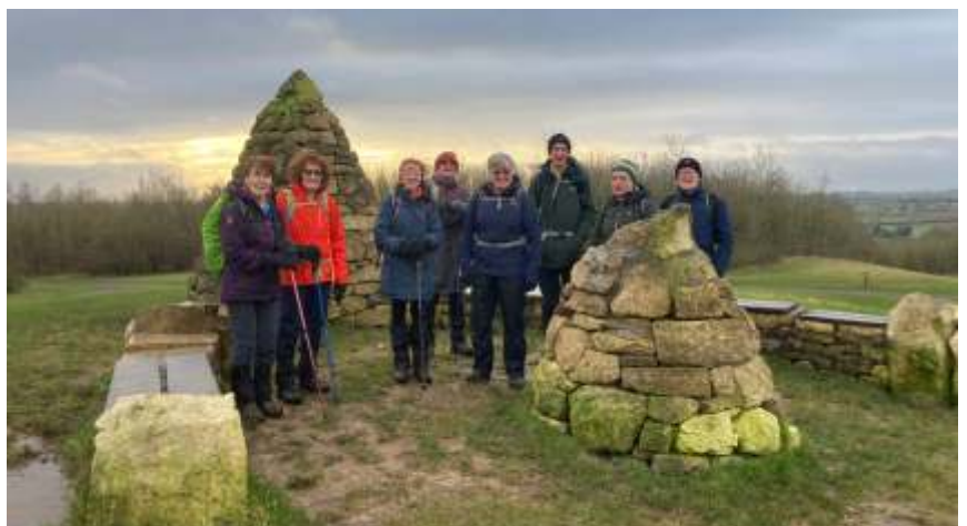
On Top of the World in Poulter Country Park