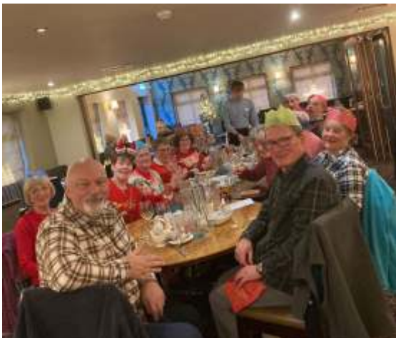
Christmas lunch at The Countryman