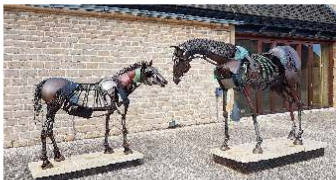
These two reminded us of the galloping steeds on the walk