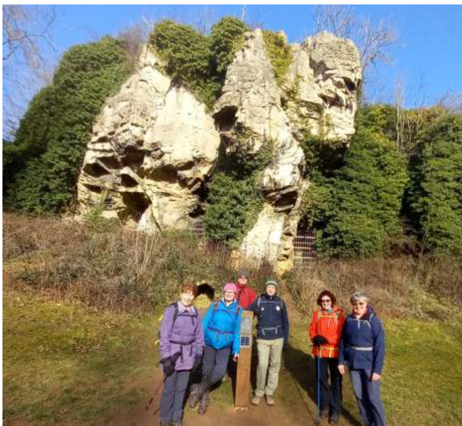
The impressive Cresswell Crag

Walking in pleasantly mild February temperatures and with very little mud to negotiate we admired the rolling landscape on the Nottinghamshire/ Derbyshire border. Stopping for lunch in a sheltered field corner, it felt as if