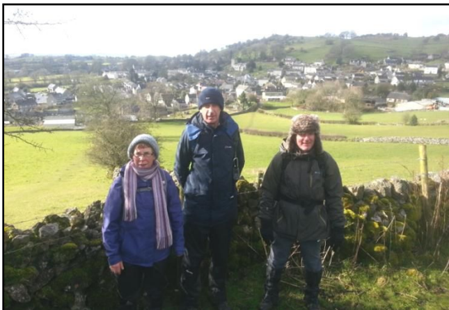
View overlooking Brassington

On route we paused to watch a mesmerising display by a male Rhea, a large flightless bird related to the Ostrich that raced around its mate at break-neck speed interspersed by bobbing and jumping.