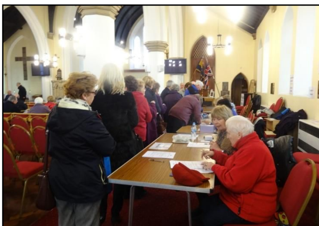
Members queuing up to renew their subscription