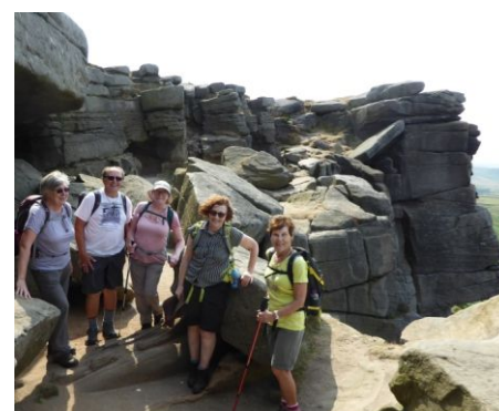
On Stanage Edge

The group's first walk in August set out from Bakewell on a hot, sunny day. Taking little-walked footpaths through the town, we headed uphill through pastures, arriving in Over Haddon for our coffee break with views overlooking Lathkill Dale. We then followed the River Lathkill, much diminished to an insignificant trickle