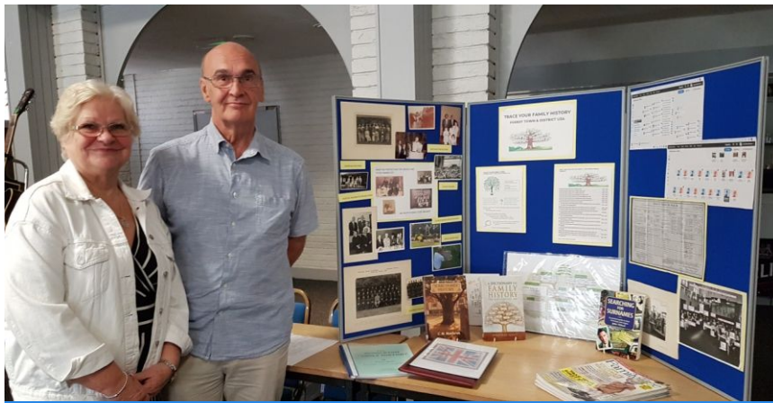
Trace Your Family Tree Group