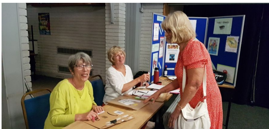
Table Tennis & Eating Out (but not at the same time) Groups