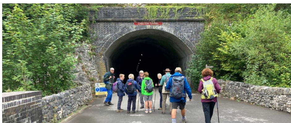
On the Monsal Trail