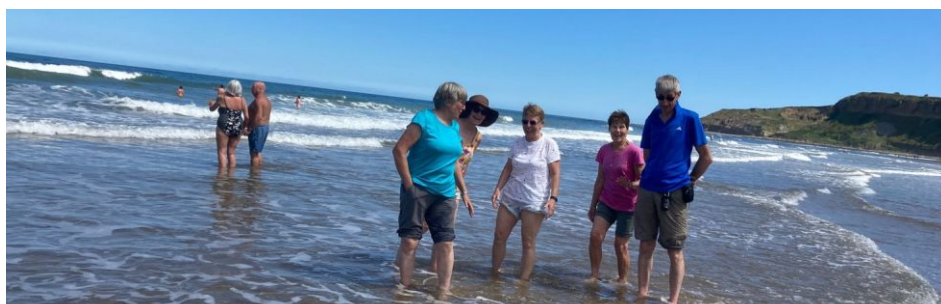
A refreshing paddle at Cayton Bay