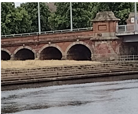
Members enjoyed the River Trent dine and cruise event