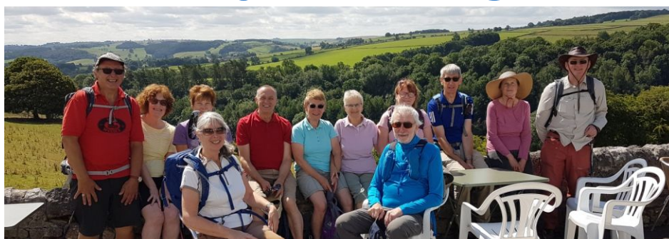
Coffee break at Over Haddon

Our final walk explored Stanage Edge high above Hathersage on a pleasantly warm and sunny day