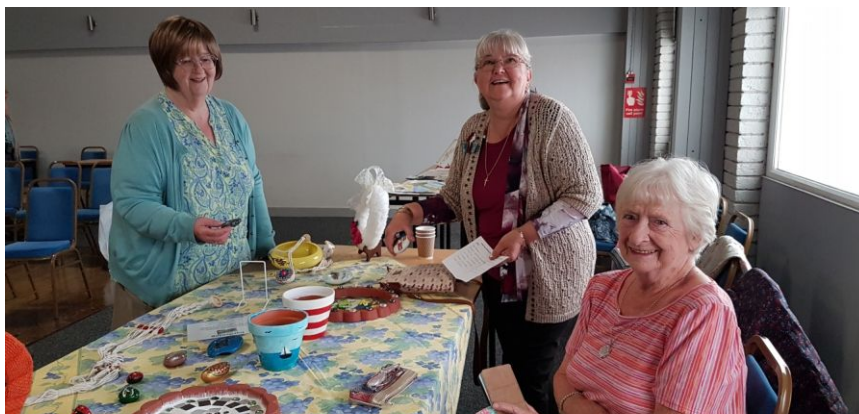
Gardening & Crafts Group