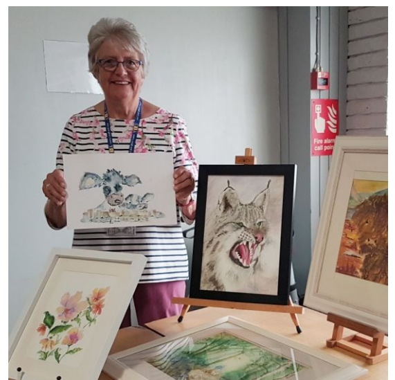
Painting & Drawing Group