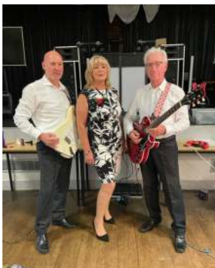
Turn Back Time will perform