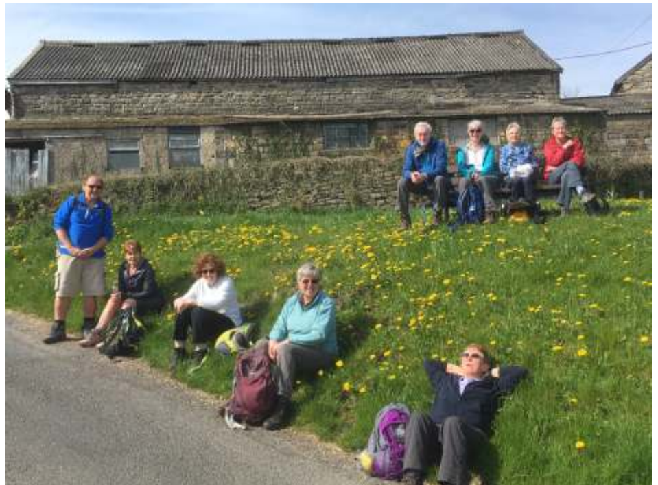
Topping up the rays on the second walk in April