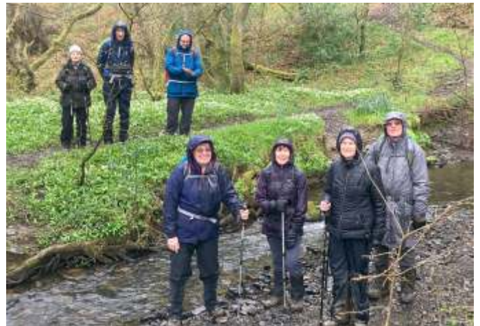
All wrapped up against the wind and the rain

Hearthstone Lane, Giddy Ledge, Matlock & Scarthin (7.8 miles) 18 May: Wortley and Wharncliffe Crag (8.5 miles). New members welcome.