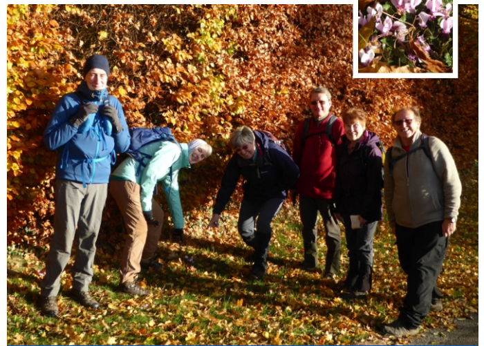
The group spot autumn cyclamen – see inset picture

An extract from the Mansfield & Sutton Times 31 December 1937