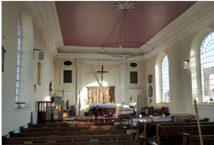
West Stockwith's simple Georgian interior