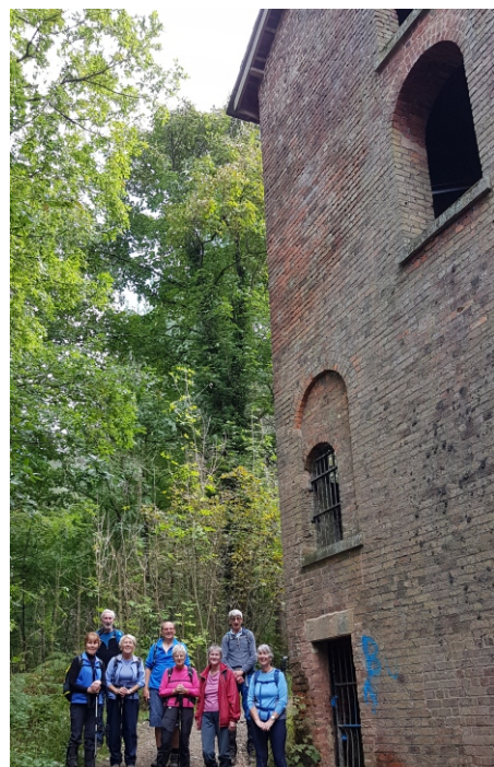
Seldom Seen Engine House

Our first ramble in October took place in the scenic Moss Valley, near Eckington on a beautifully warm and sunny day. Starting in the village of Ford, the route took us along quiet country lanes through pretty hamlets, paths through woods past disused mill ponds and farm tracks through rolling countryside. We took our morning break in the grounds of Troway Hall with glorious views over the valley where the owners chatted