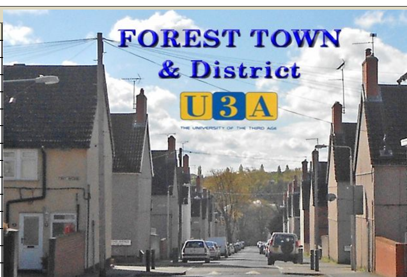
The Avenues today